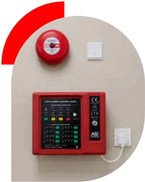
FIRE ALARM SYSTEM